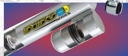
Fixed CrossFlow Reservoir Increases oil capacity for greater cooling and allows for additional shaft travel